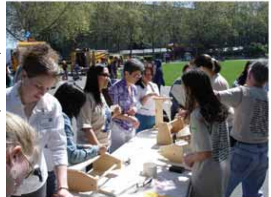
Photographs taken from a recent Women in Trades Fair at the Seattle Center

or letter and would like a copy, please send your mailing address to lily@CSISeattle.net . Also, you can check our website at www.nawicpugetsound.org for more information, including contact information and other chapter happenings.