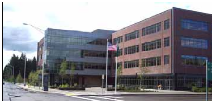
Tumwater Office Building was named Contracting Business' Design/Build Award winner for 2005.

Working for a design-build mechanical contractor, LEED issues come up more and more. The LEED green building rating system is a point based rating system developed by the U.S. Green Building Council to provide a standard for the construction industry to assess the environmental sustainability of building designs. The trick is usually finding a balance between upfront costs, figuring out what LEED points are attainable for the project, and making sure those are aligned with what the building's functions will be.