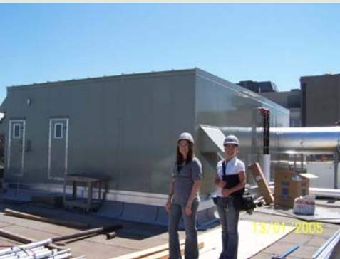
Some of the upgrades included running

This is a unique project at for the Virginia Mason Hospital because the work took place at the Lindeman Pavilion Building (LP) which is a medical office building not classified to have full surgical operating rooms. In order for this to be achieved many upgrades had to be done. The entire 5th floor had to be converted into a operating/hospital facility with four operating rooms.