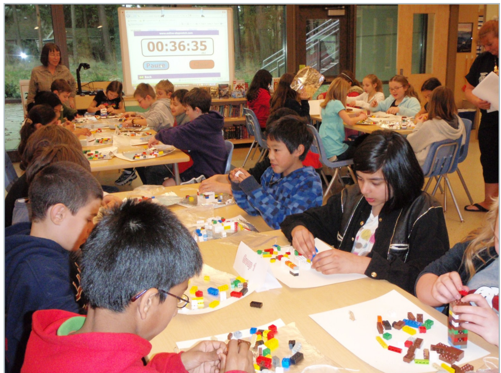
Robert Frost fifth graders hard at work on their Block Kids projects.